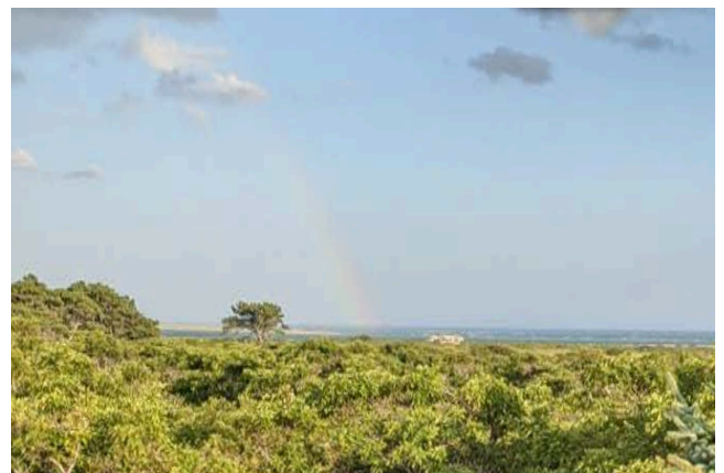
The sun set over Bigelow's Point with virtually no wind on Friday. Earlier that day, a rainbow appeared in the east over Whale Point, seemingly touching down right on the landing strip.

***Tuckernuck Island is private property, accessed only by explicit permission by landowner(s).***