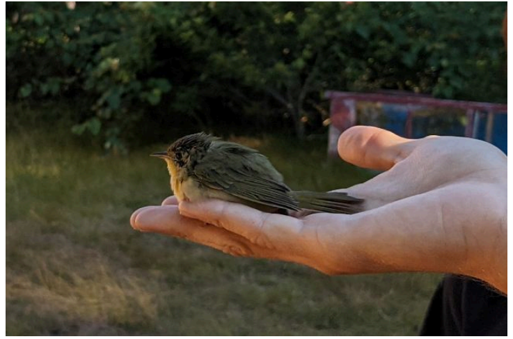
A Black-capped Chickadee was extracted on Saturday during a standard mist net operation at the firehouse. A juvenile Common Yellowthroat was released after being banded.