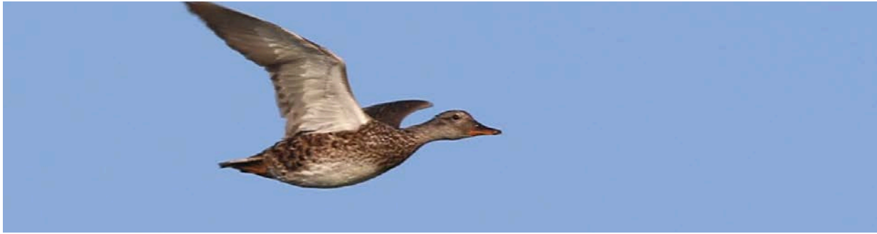
A female Gadwall flies over the Salt Hole on the island's east end. Five juveniles were also seen in the small reed pond, confirming the breeding success of this species.