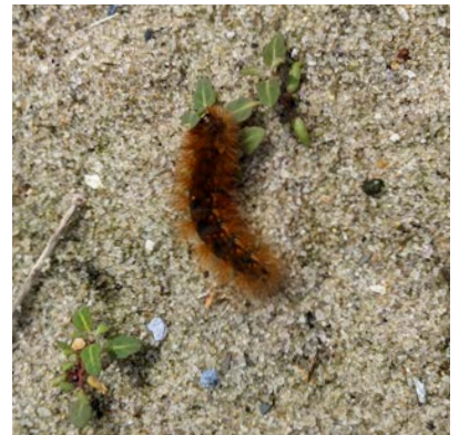
An island homeowner brought several Japanese Quails to the island this week. This one flushed nearly underfoot in the driveway of the field station. A Saltmarsh Moth Caterpillar was seen on Muskeget.