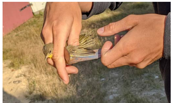
Bird banding took place over the weekend, with several species caught for the purpose of aging, sexing, and determining breeding status. A molting Black-capped Chickadee and female Common Yellowthroat are shown above.